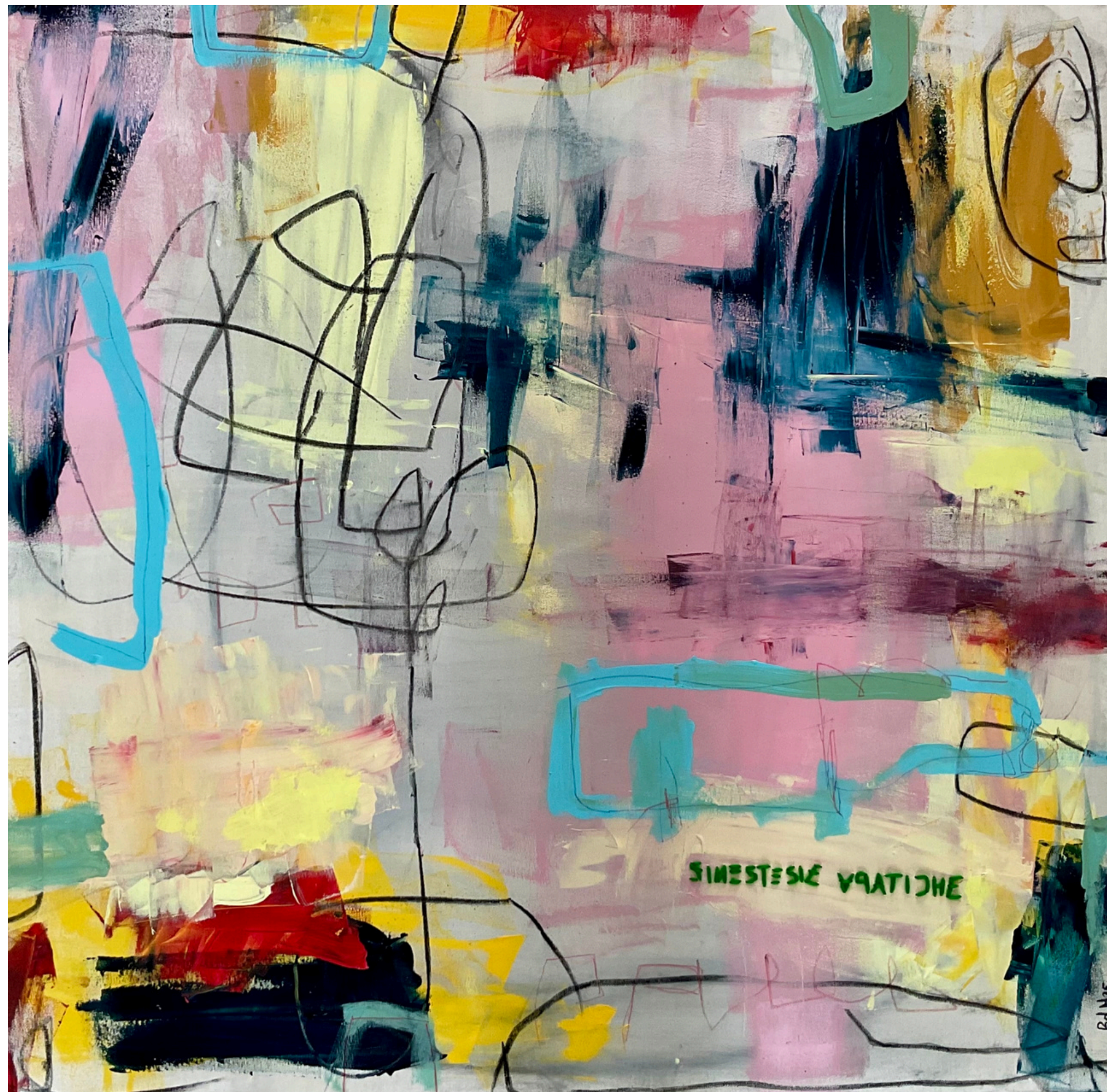
Sinestesie Apatiche 2025 acrylic, charcoal, wool on canvas, 100x100 cm