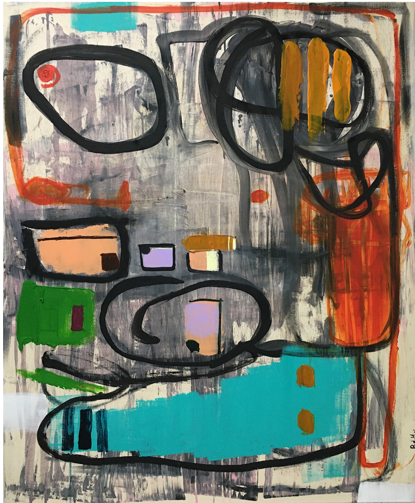
Walking in the city at night, 2024, acrylic, charcoal, oil pastels on canvas, 120x100 cm