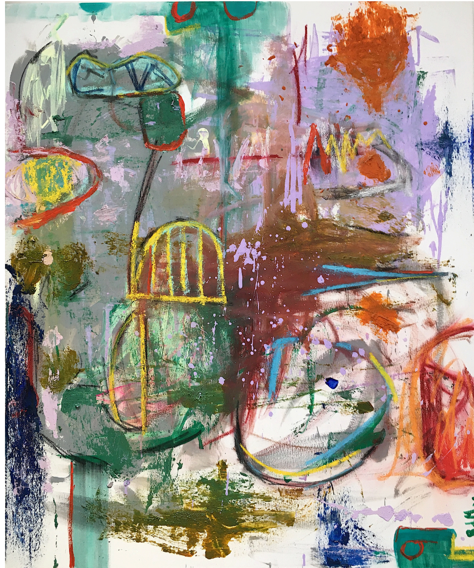
Unstructured 2023, acrylic, charcoal, oil pastels on canvas, 120x100 cm