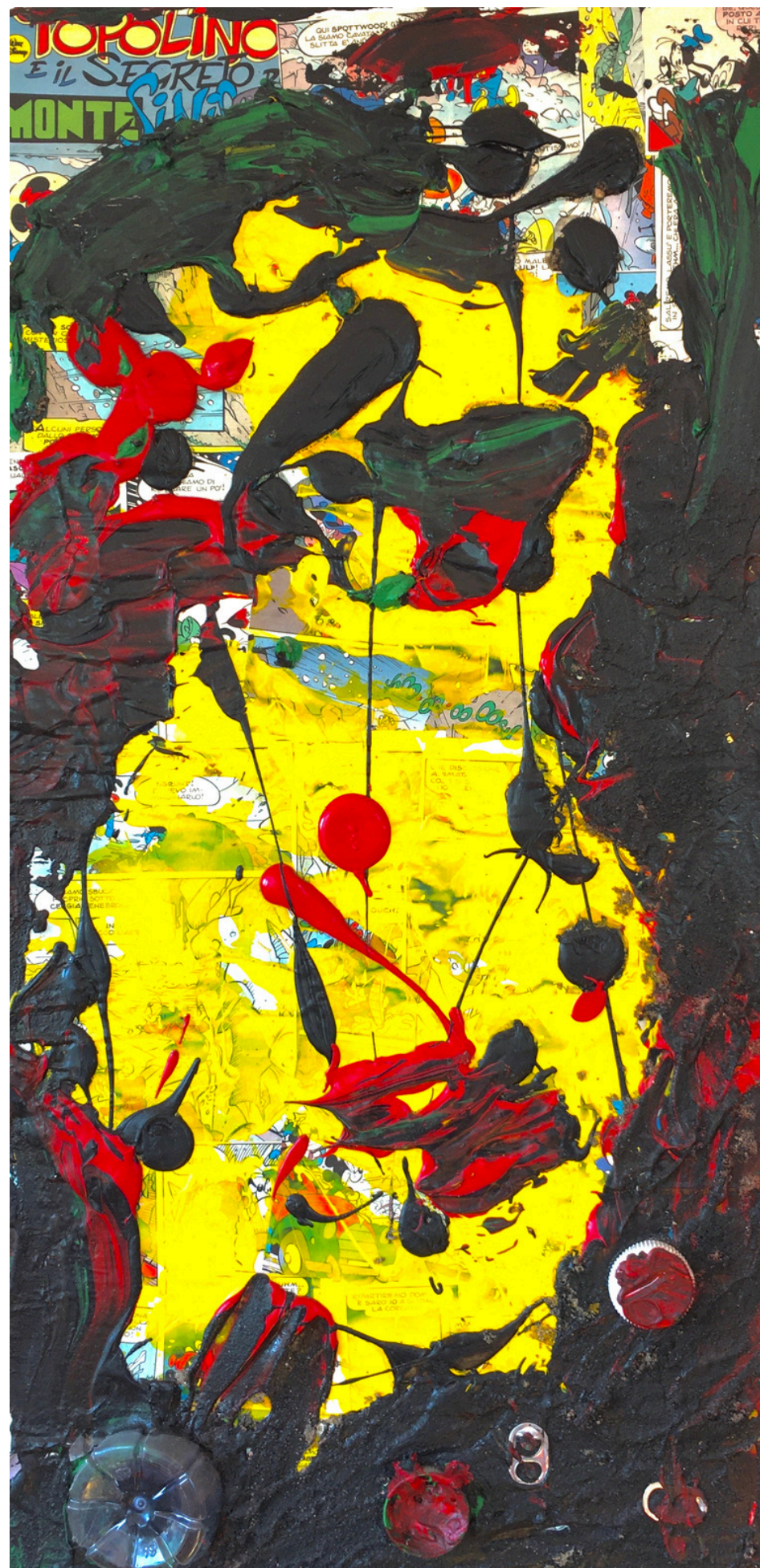
Layers , 2018, acrylic, sand, metal plastic elements on canvas, 30x60 cm