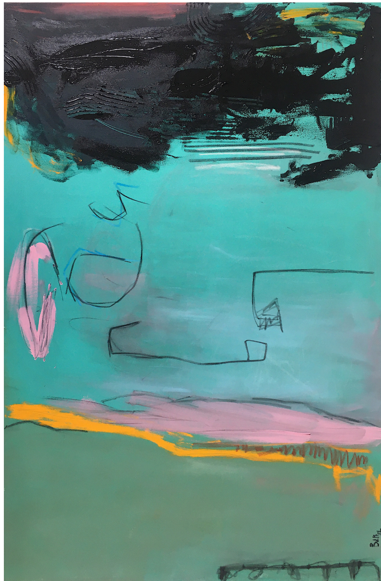
Distorted Clouds , 2024 acrylic, charcoal, oil pastels on canvas, 150x100cm