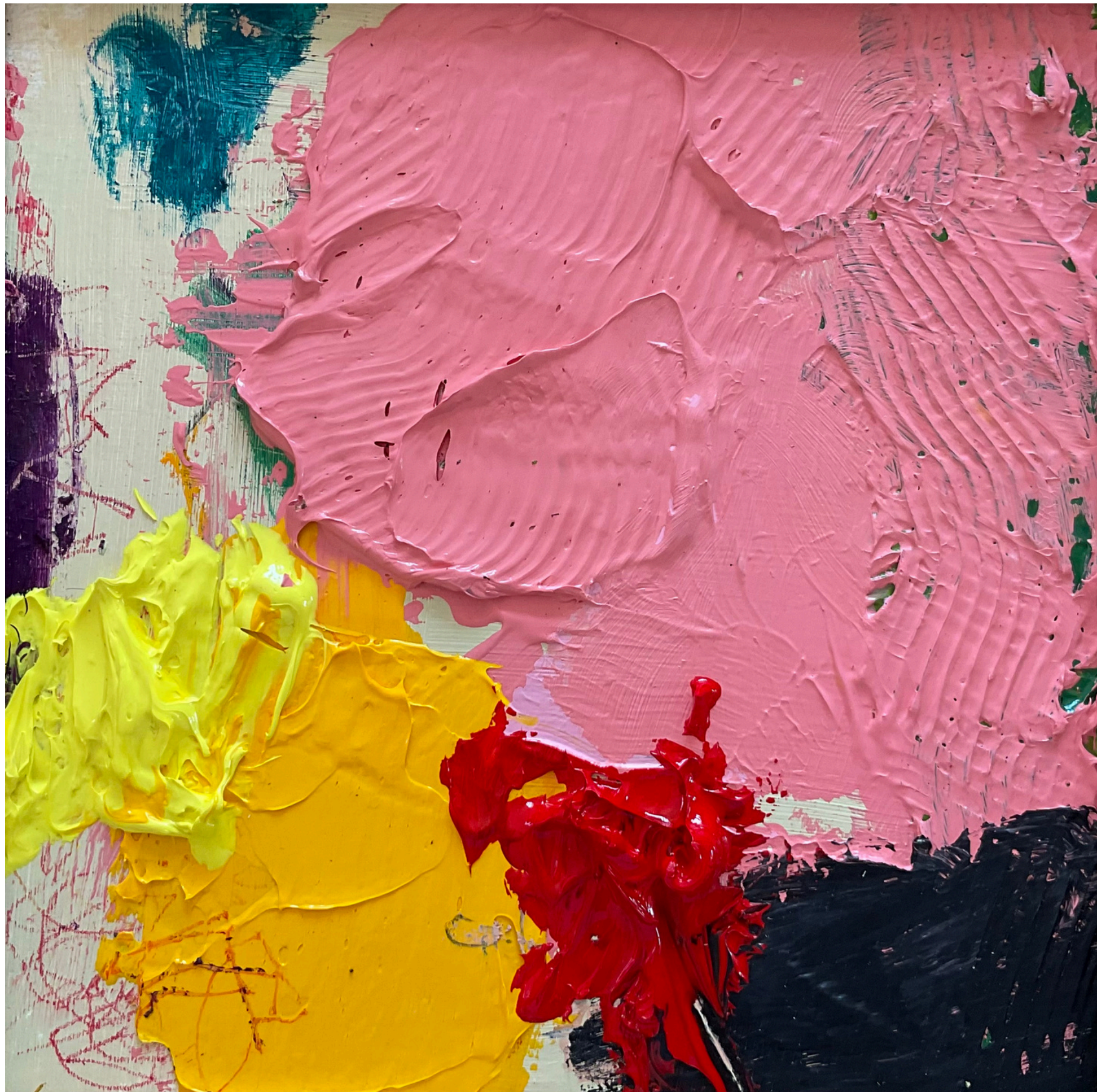
Sinestésie Minime V 2025 , acrylic, charcoal, wool on canvas, 20x20cm