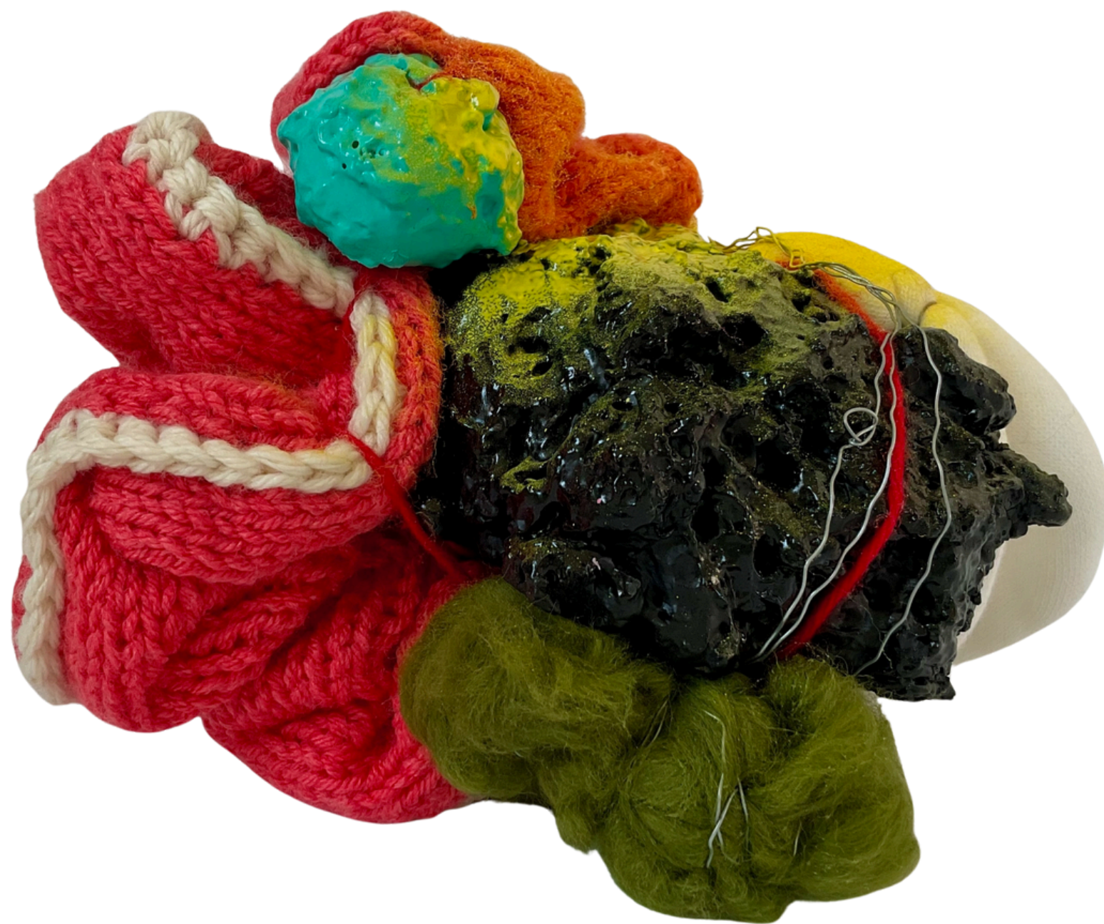
Utopia of the Free Thinking 2025 , acrylic, steelwire, wool, plastic, paper, 25(L)x18(H)x25(D)cm