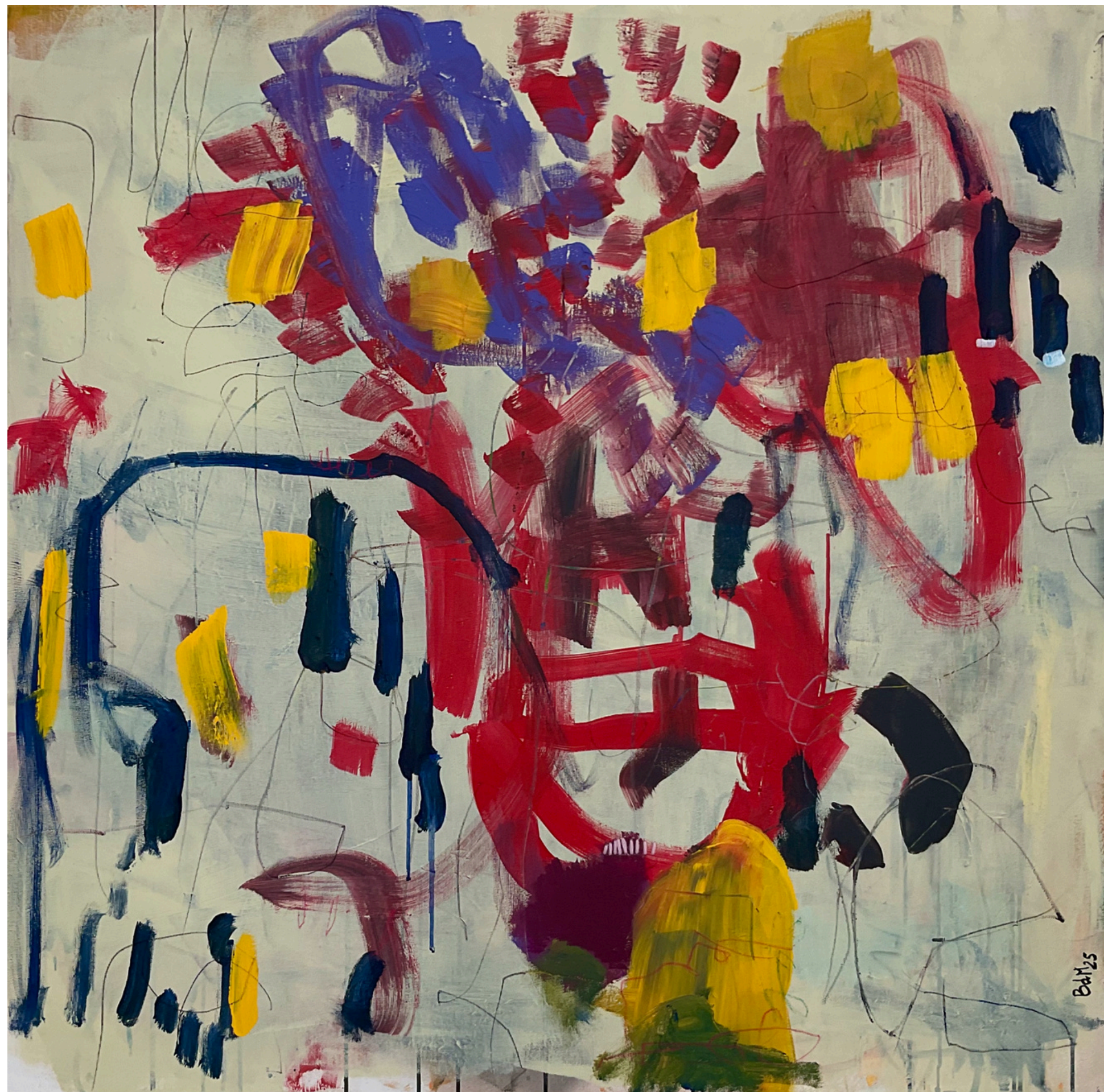
Inner Space 2025 Acrylic, charcoal, wool on canvas 100x100 cm