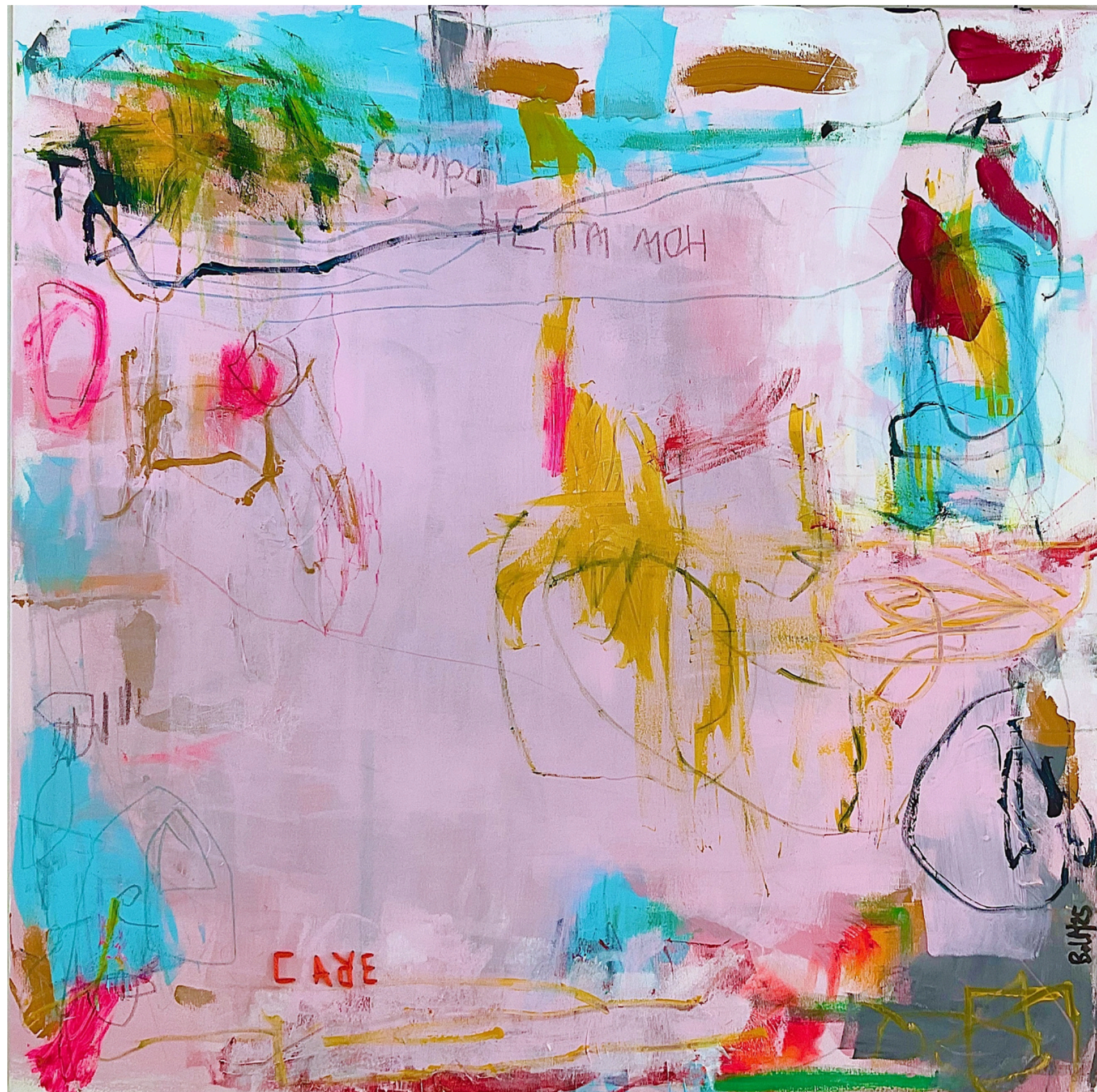
How Much You Care, 2025, acrylic, charcoal, wool on canvas, 100x100 cm