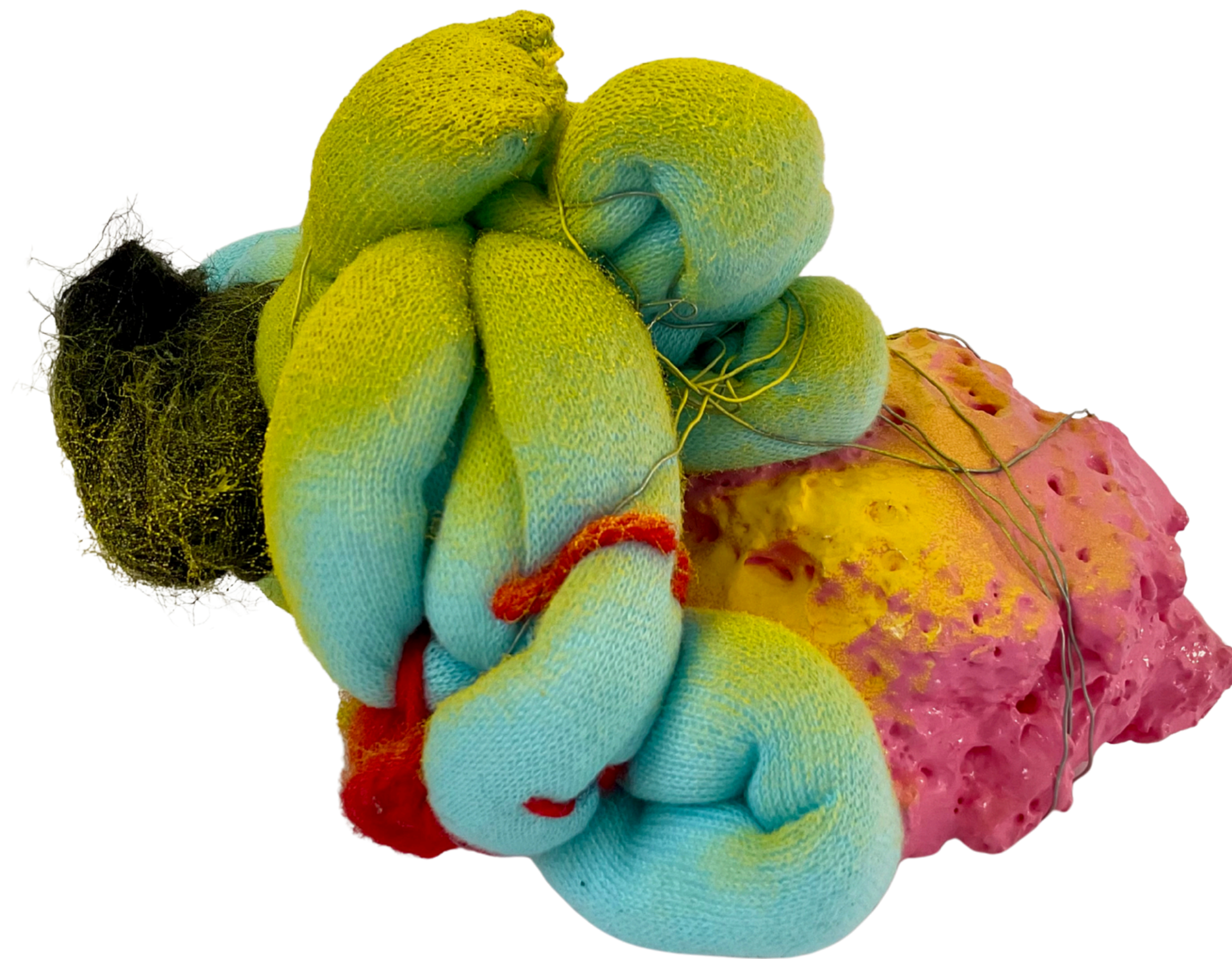
Lollipop War 2025, acrylic, steelwire, wool, paper, plastic , textile, 20(L)x17(H)x21(D)cm