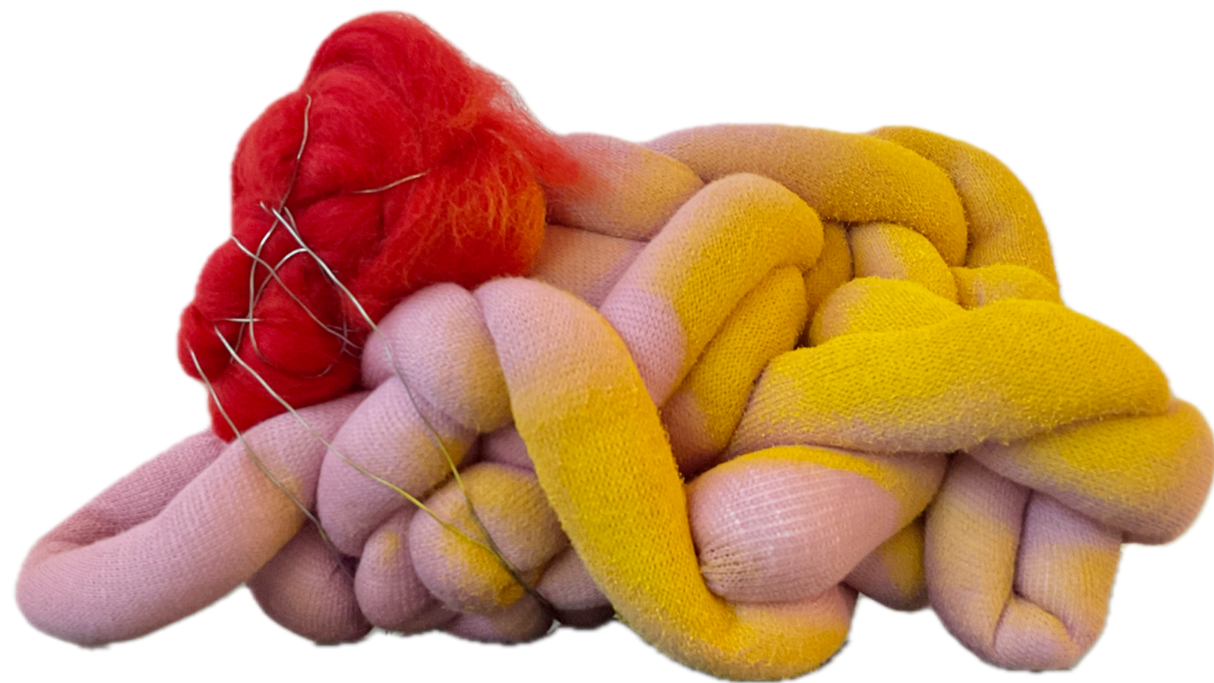
Let's Play 2025, acrylic, textile, steelwire, wool , 29(L)x18(H)x15(D)cm