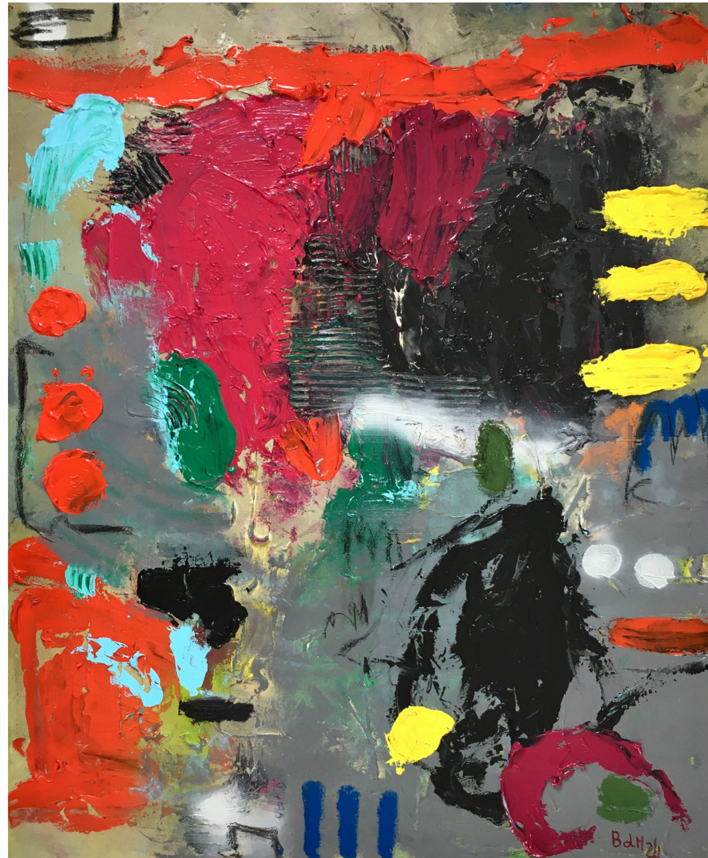
Ecletticismi Piatti , 2024, acrylic, charcoal, oil pastels on canvas, 120x100cm