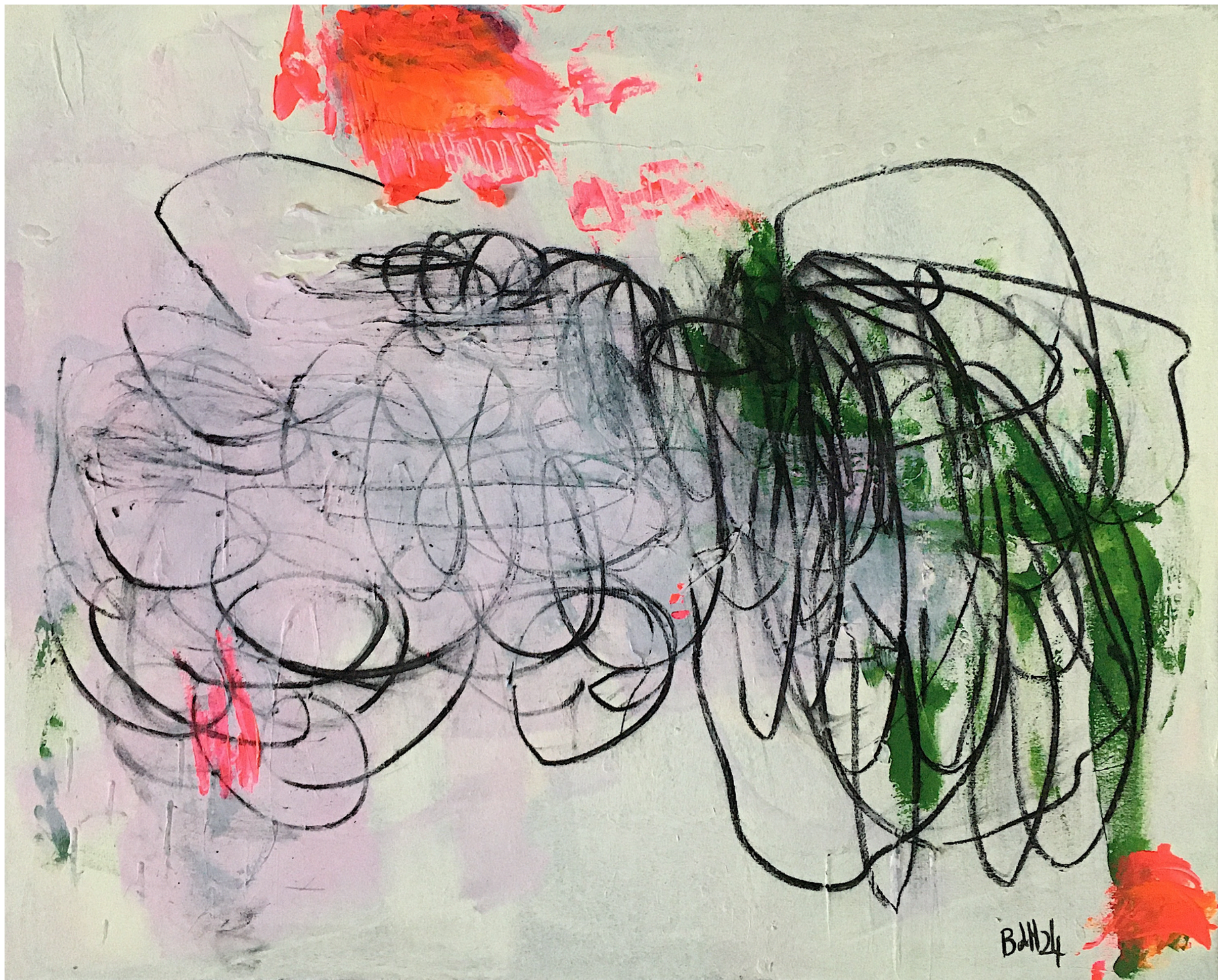
The Night That Falls, 2024, acrylic, charcoal, oil pastels on canvas, 80x100cm