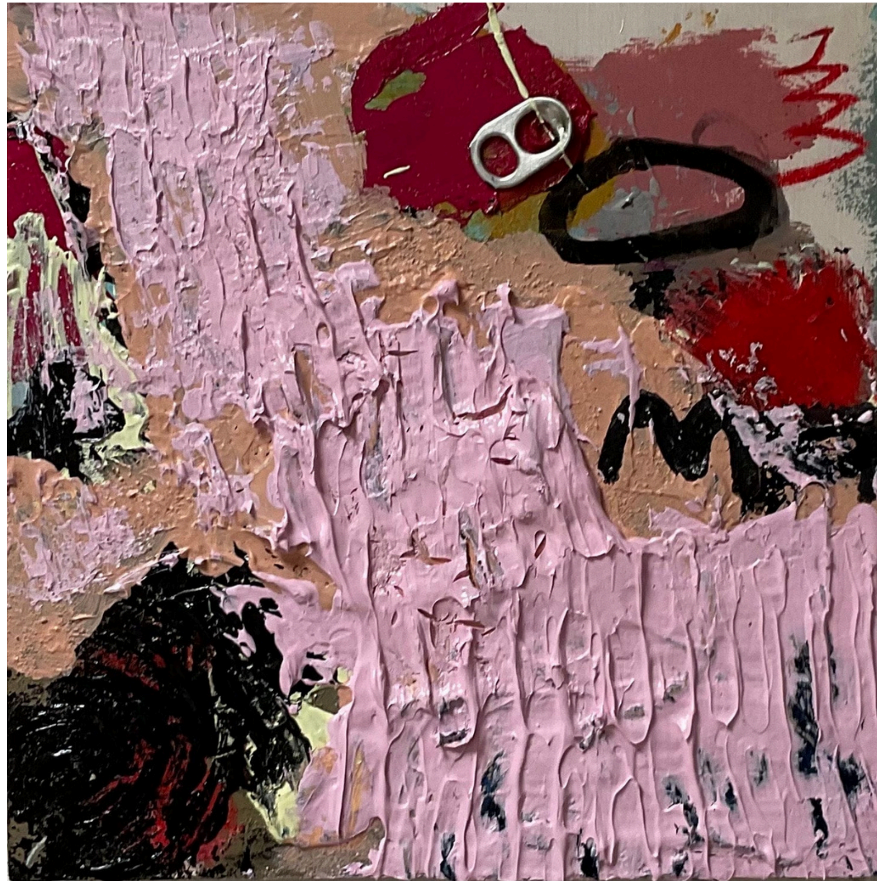
Candy Blast , 2024, acrylic, charcoal, oil pastels, metal elements on wood 20x20cm